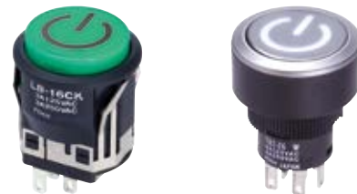
IEC 60417-5009 example (LB series, YB2 series)

Switches that set ME equipment to a standby state correspond to those that turn power on or off by activating a relay or semiconductor when a momentary pushbutton switch is pressed. In this case, the switch opens and closes a secondary circuit, not the primary circuit, but the switch marking must clearly distinguish it from a primary power switch; the switch may use symbol 29 in Table D.1 (IEC 60417-5009), commonly referred to as the standby symbol.