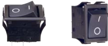
IEC 60417-5007/5008 (example JW Series)

Power supply switches must use the graphic symbols "I" and "O" or indicators to clearly indicate the power on/off status.